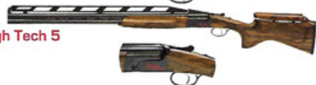
High Tech 5