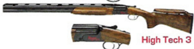
High Tech 3