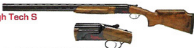
High Tech S