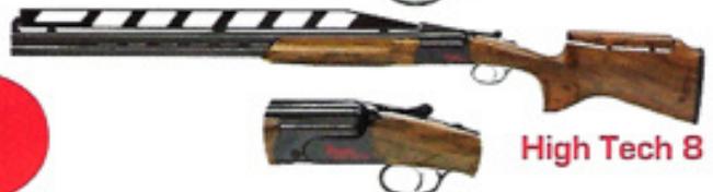
High Tech 8